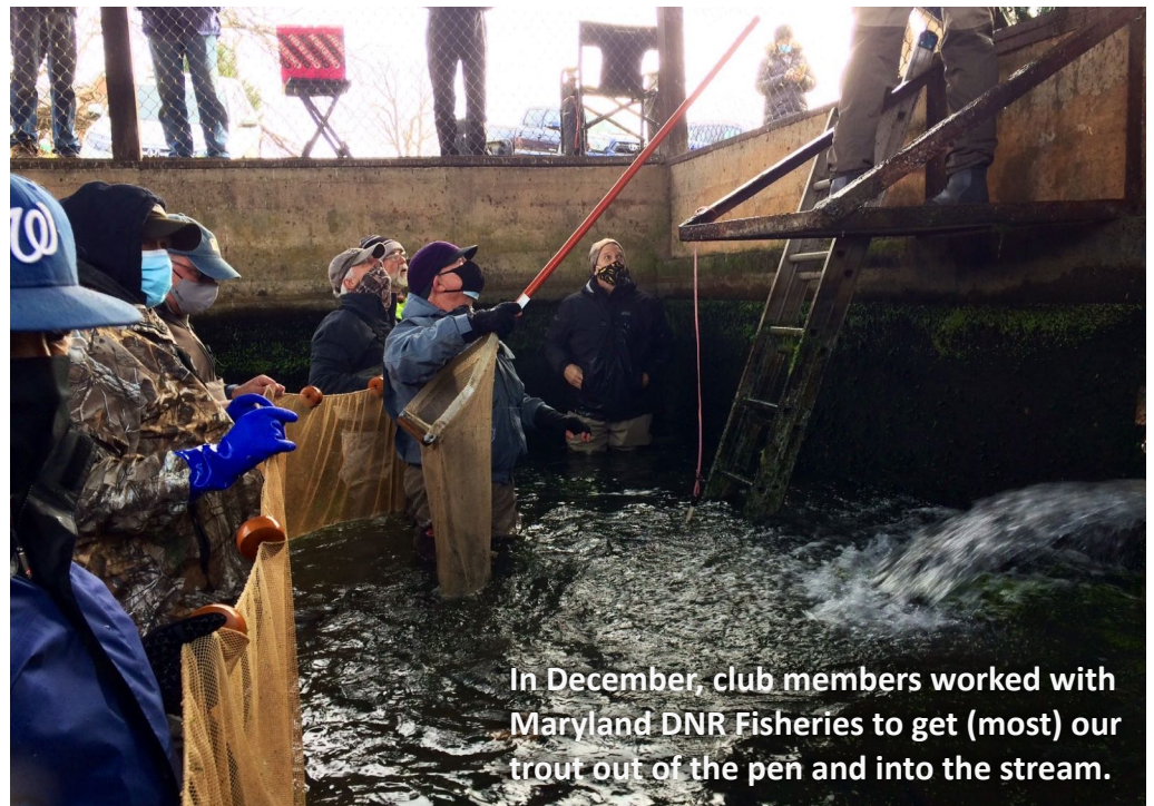
In December, club members worked with Maryland DNR Fisheries to get (most) our trout out of the pen and into the stream.

In addition, we are going to discuss some of our new initiatives – Advanced Fly Tying Roundtable, Mentor program, and our revised Outings program.